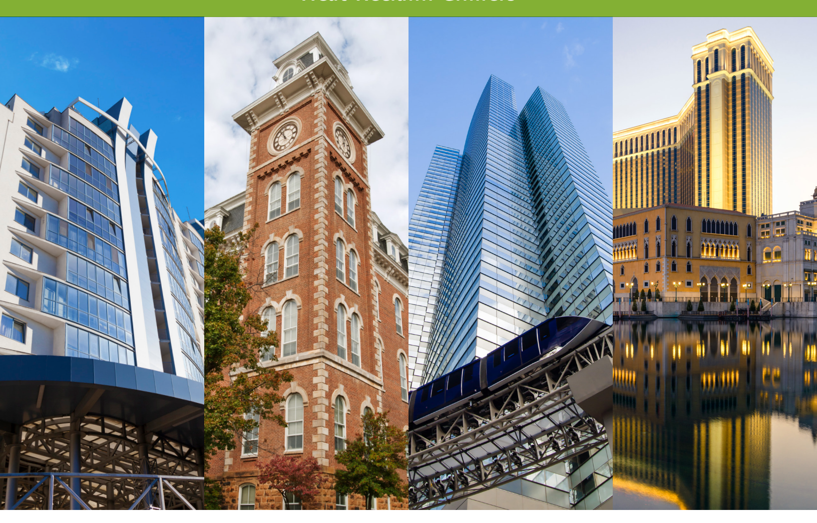
Capturing Heat for Useful Energy Savings